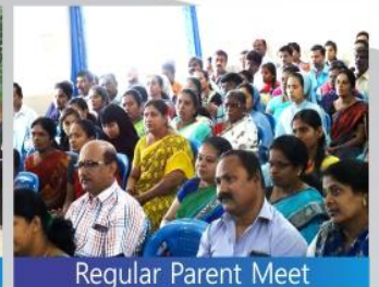
Regular Parent Meet